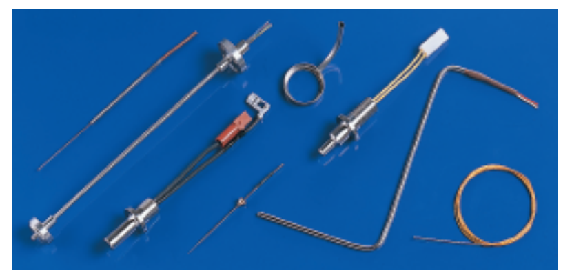
sensors, temperature control