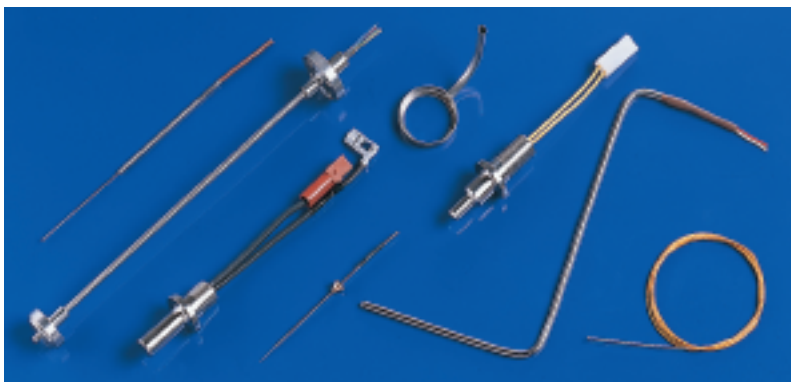
sensors, temperature control